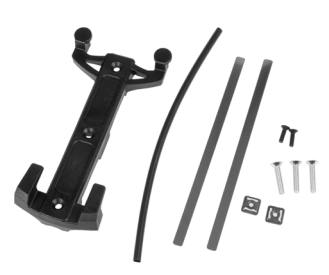
Quick-Lock S adapter plate incl. mounting accessories (included in delivery)